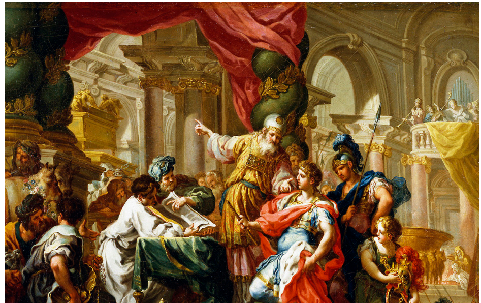
Alexander the Great in the Temple of Jerusalem, Sebastiano Conca, 1736. Museo del Prado, Madrid.